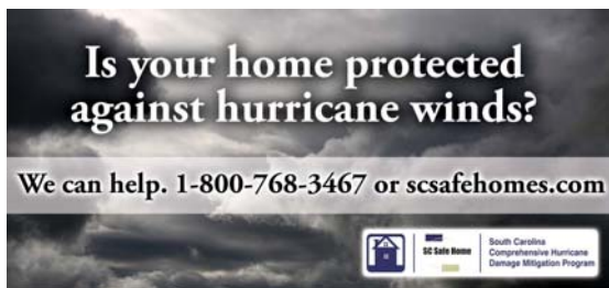
SC Safe Homes Billboard